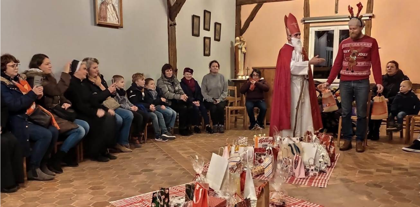
Santa Claus came to the grown-ups and the little ones

which travels "from family to family," is received with great devotion. We all need the example of the life of the Holy Family of Nazareth, its care and blessing.