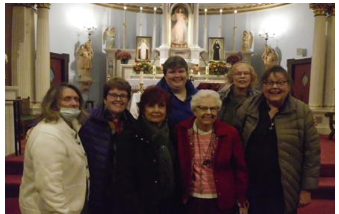
Associates from Worcester

Our regular meeting will continue with prayer and Scripture studies, and we look forward to welcoming new members.