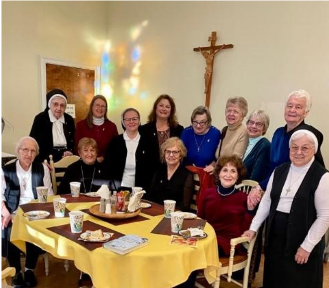
Associates during their meeting in Monroe, CT