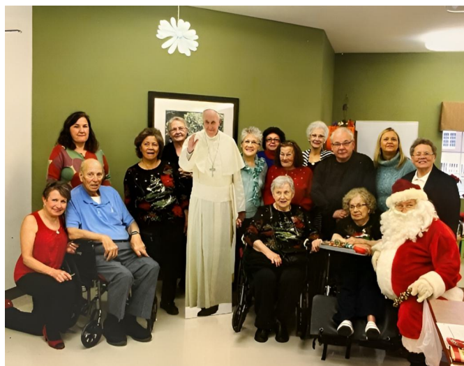
Members of the AHF from Cleveland at Christmas Party with the Pope and Santa at the Breckvillee of Oaks Retirement Home.

Nazareth - is the never-fading star which beckons to The Meeting.