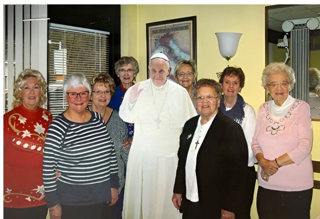
Members of the AHF in Pittsburgh, Pennsylvania. “If we cannot go to Rome to see the Pope- The Pope came to Pittsburgh-to us.