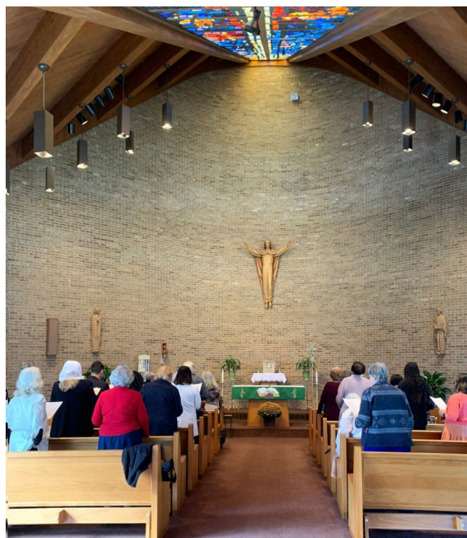
Members of the AHF gathered in the convent chapel in Grand Prairie.